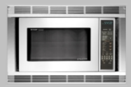
Sharp's R-930CS Convection Microwave is the perfect second oven. It can be built into a 27" or 30" opening utilizing one of these matching built-in kits.